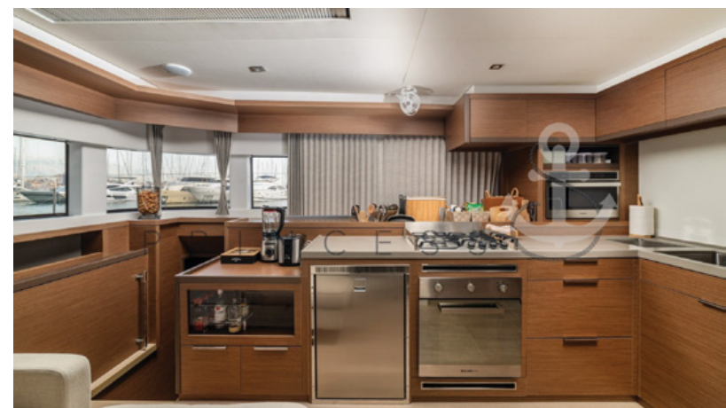
galley & saloon